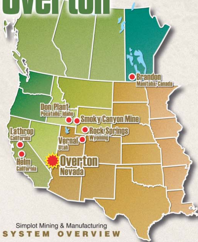
Simplot Mining & Manufacturing SYSTEM OVERVIEW