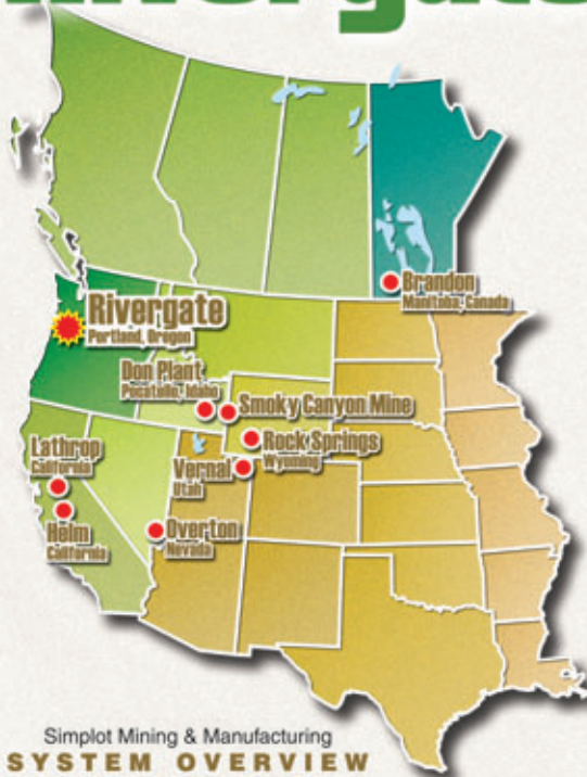
Simplot Mining & Manufacturing SYSTEM OVERVIEW

Urea shipped from the Rivergate facility reaches markets throughout the western United States. The product is delivered by conveyors from the warehouses, then passes through a screening system where undersized and oversized urea is removed prior to loading into bulk trucks and railcars. The facility has two rail and two truck loading stations. Urea loading is done directly into trucks and railcars on certified scales. Rivergate warehouse operations also include packaging urea in super-sacks up to one ton in weight for distribution.